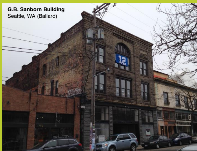
G.B. Sanborn Building Seattle, WA (Ballard)

For enabling legislation, see RCW 84.26 and administrative rules WAC 254-20 and WAC 458-15