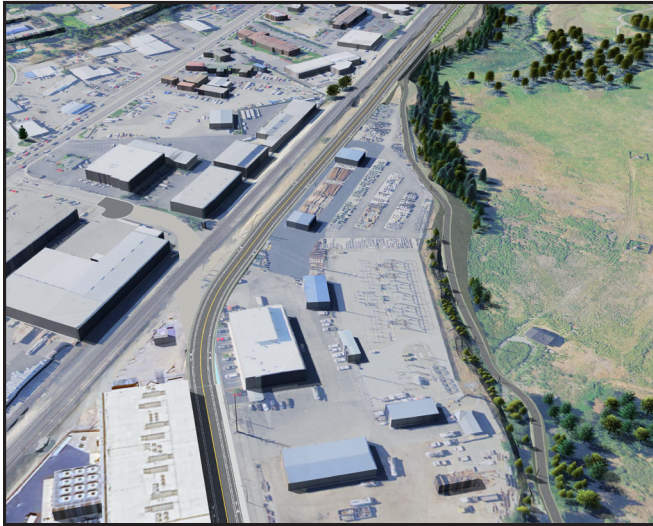
Looking northwest at the new roadway connecting Hawley St and the new bridge over the Wenatchee River

(Wenatchee River Crossing - Preliminary Concept Illustrations, July 2024)