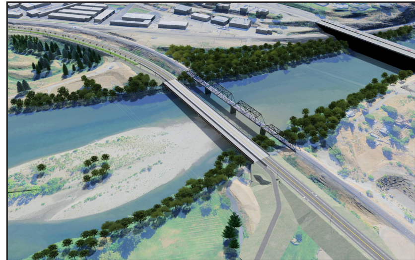
Looking southwest at the new bridge and trail connection over the Wenatchee River