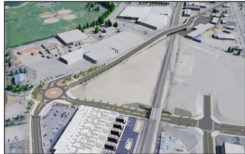
Looking southeast at the new bridges to separate McKittrick St and Confluence Parkway from the BNSF Railway