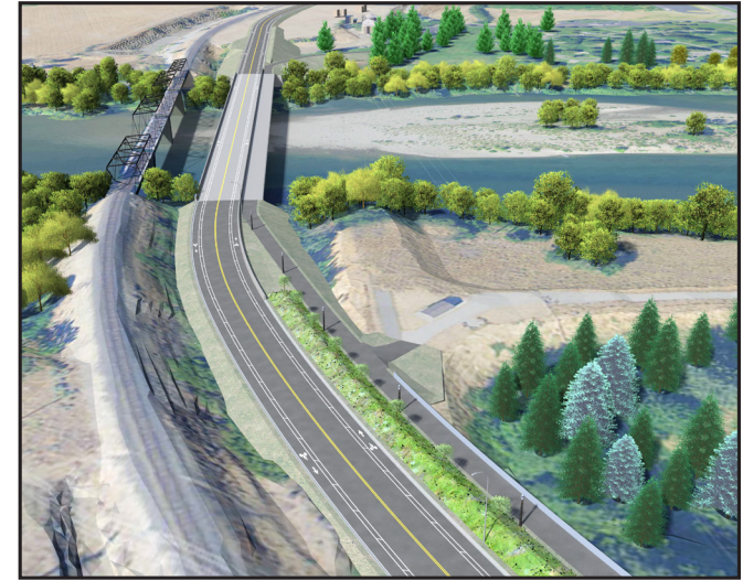
Looking north at the new roadway, bridge, and trail connection over the Wenatchee River