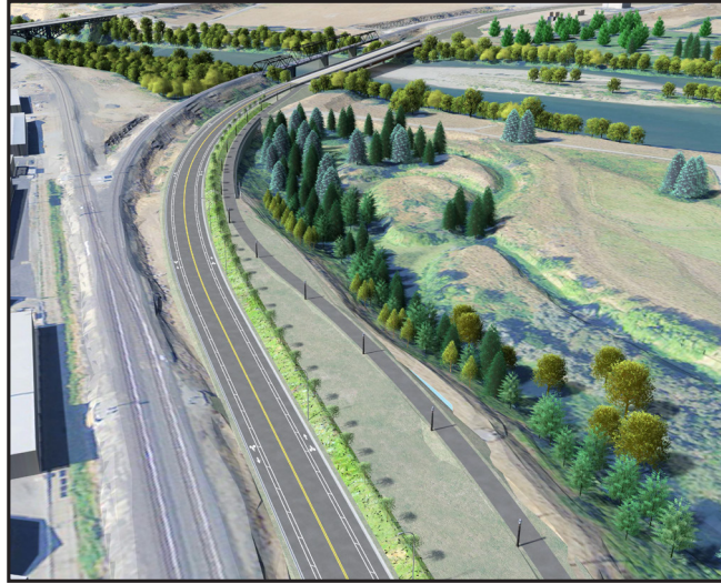
Looking northwest at the new roadway, bridge, and trail connection over the Wenatchee River