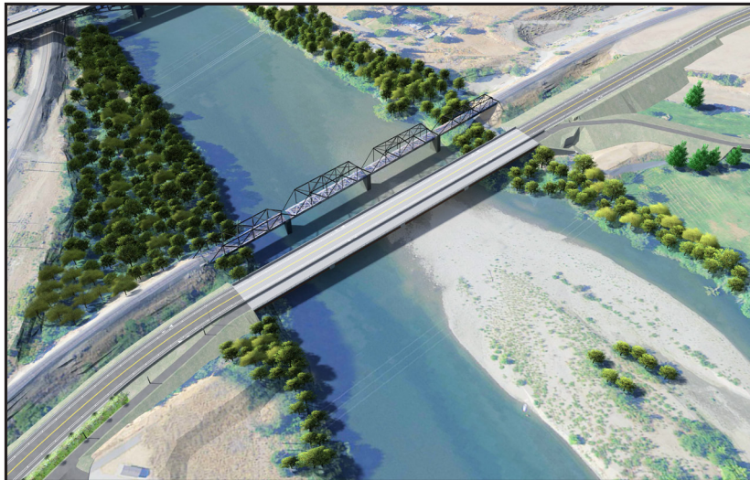
Looking northwest at the new bridge and trail connection over the Wenatchee River