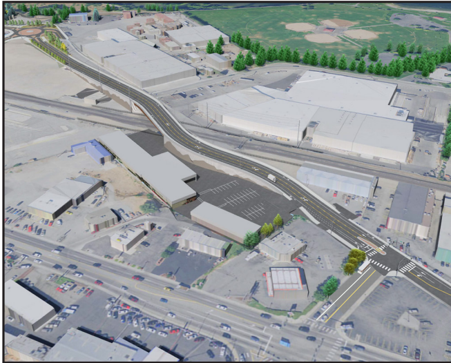
Looking northeast at the new Confluence Parkway overpass, Walla Walla Point Park, and surrounding roadway improvements