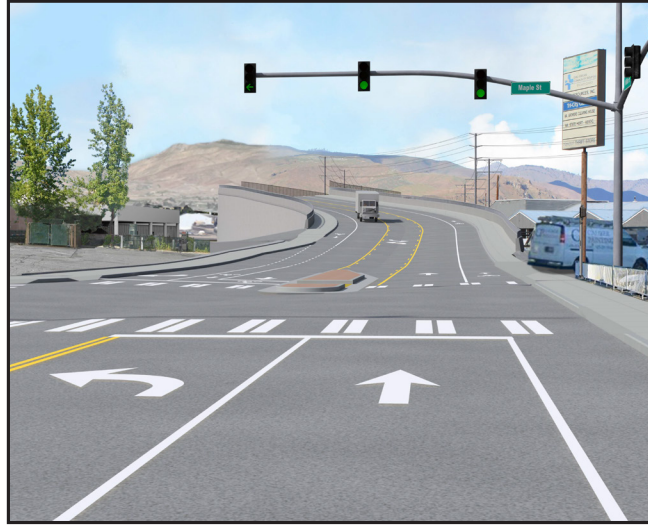
Street view looking north from the Maple St and N Miller St intersection of the Confluence Parkway overpass of the BNSF Railway