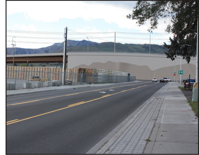
Street view looking west down Walla Walla Ave at the new Confluence Parkway overpass of the BNSF Railway