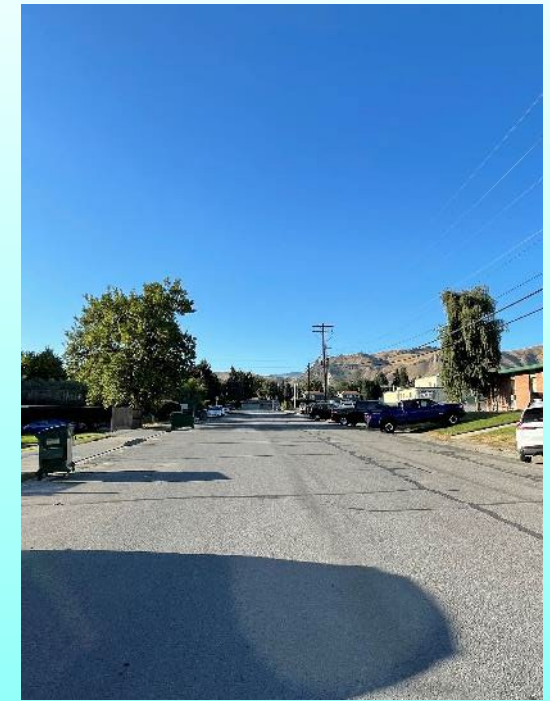
Ringold- South of Morris Street