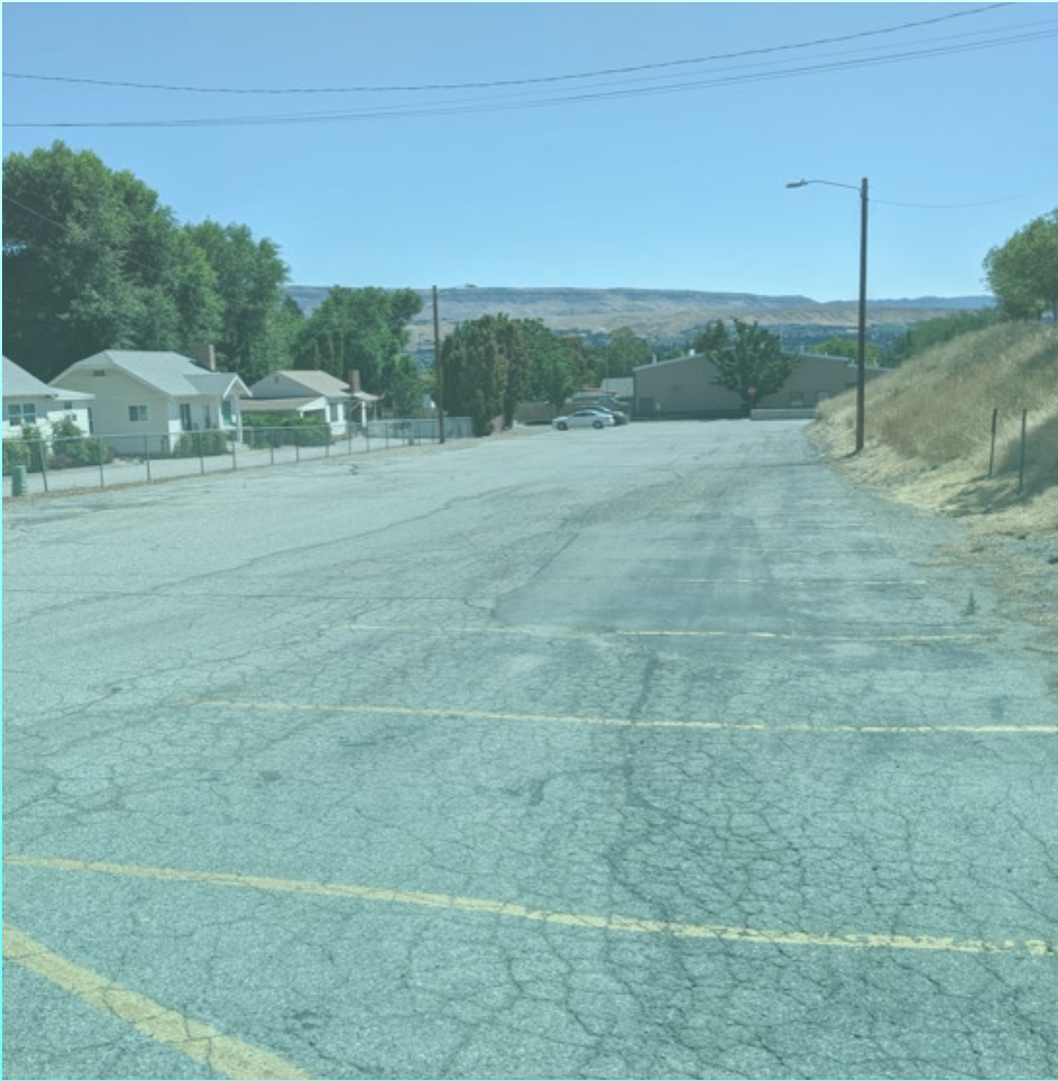
Lower Wells House parking lot will get an underground detention vault and new paving