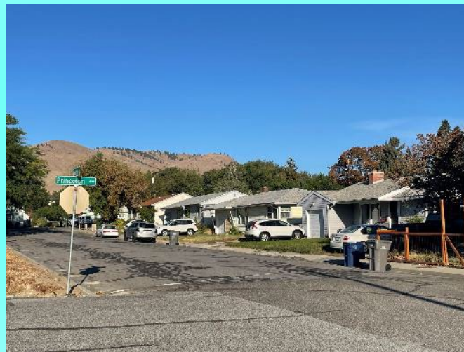
7 th and Princeton