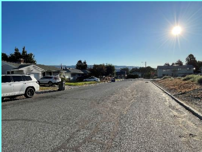
7 th Street