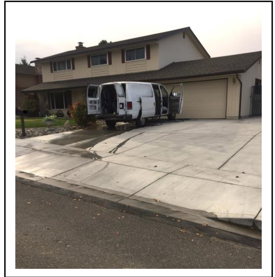
Carpet cleaner emptying waste water into driveway, Wenatchee.

The effectiveness of the program was evaluated based on the number of businesses who were disposing of wastewater in accordance with the “Dump Smart Tips for Properly Handling Waste Water when Carpet Cleaning” and how many businesses were carrying spill kits. Responses from the test population were compared to the control population to determine if there was a significant difference in the wastewater disposal practices and spill preparedness between the two groups.