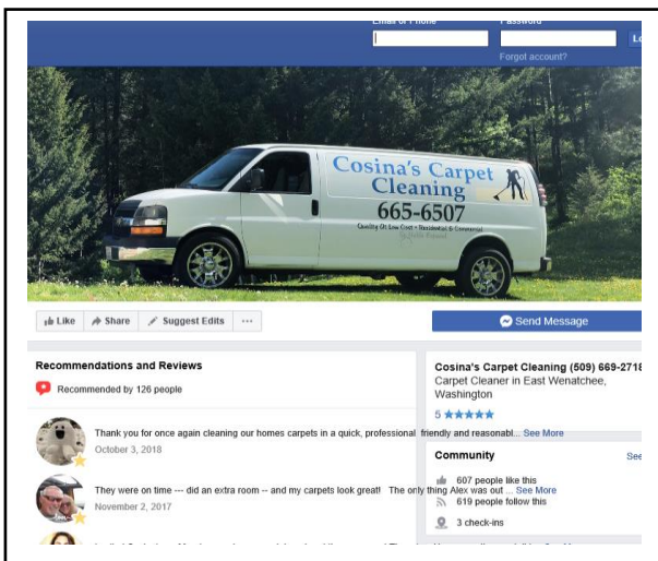
Example of carpet cleaning van showing different phone number than website